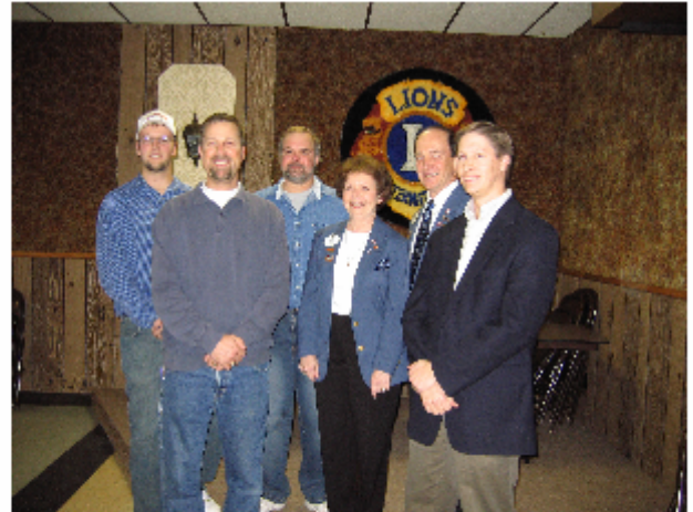
New Hector Lions.....