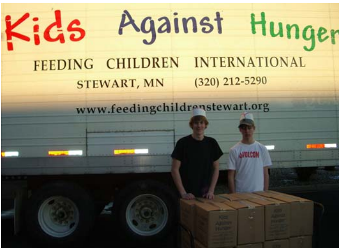
Montivedeo Leo's collecting food for "Kids Against Hunger" at the Mid-Winter Convention.