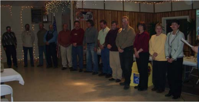
Evansville Charter Members.